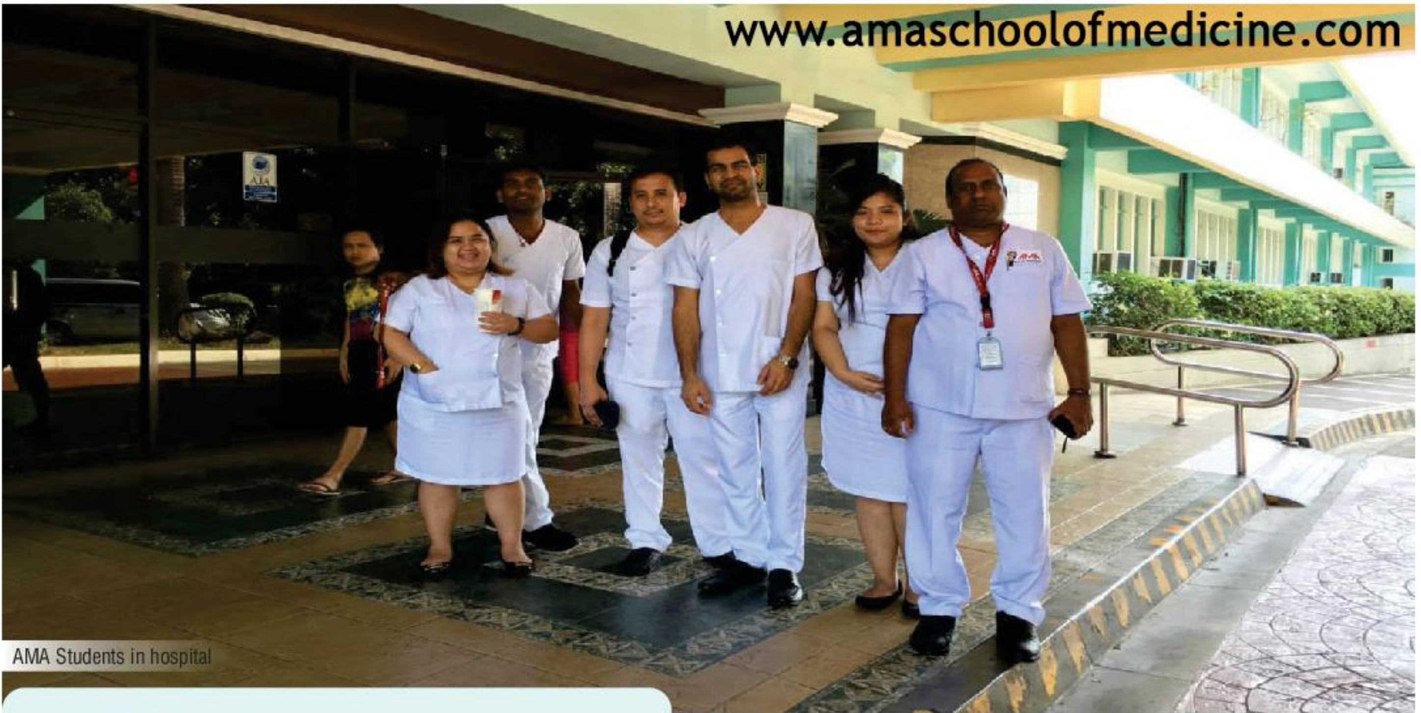
AMA Students in hospital