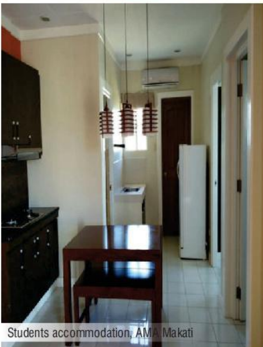
Students accommodation, AMA Makati