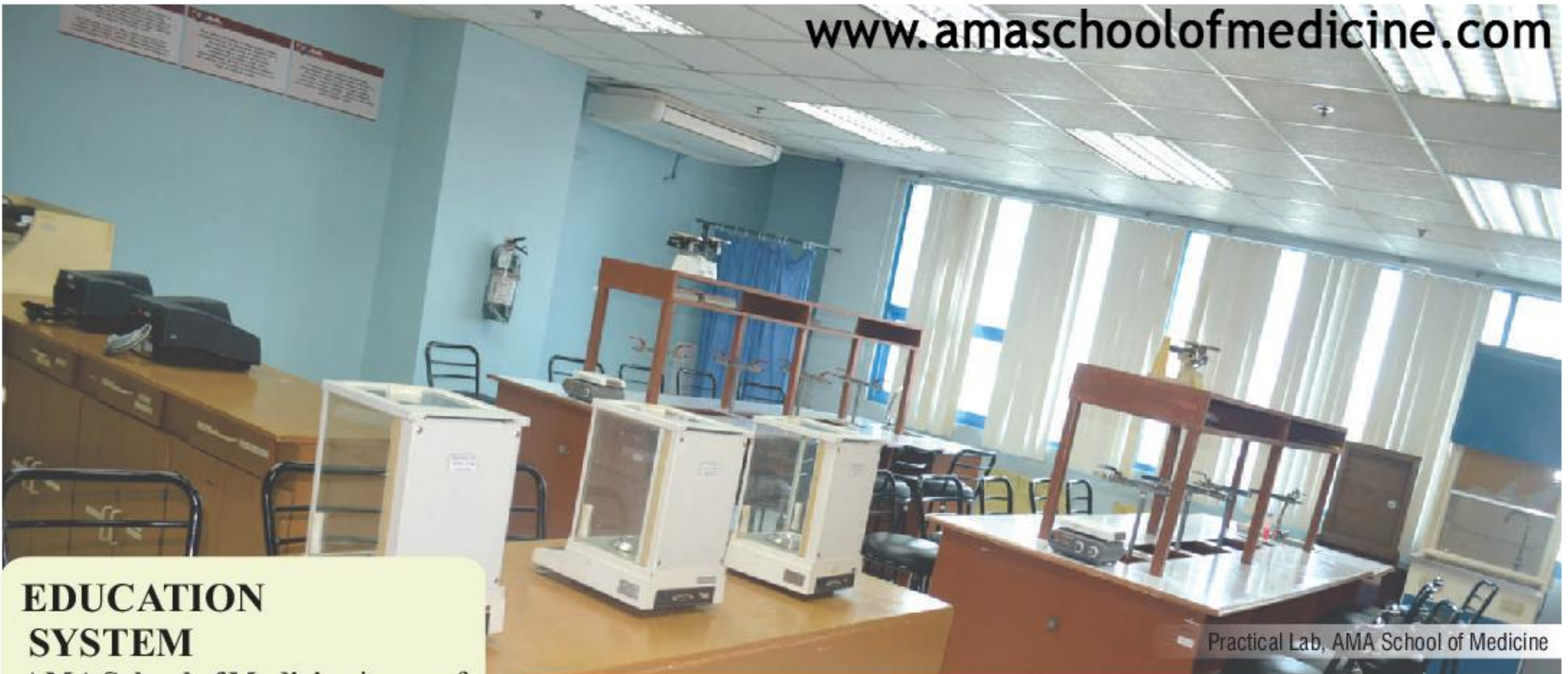
Practical Lab, AMA School of Medicine