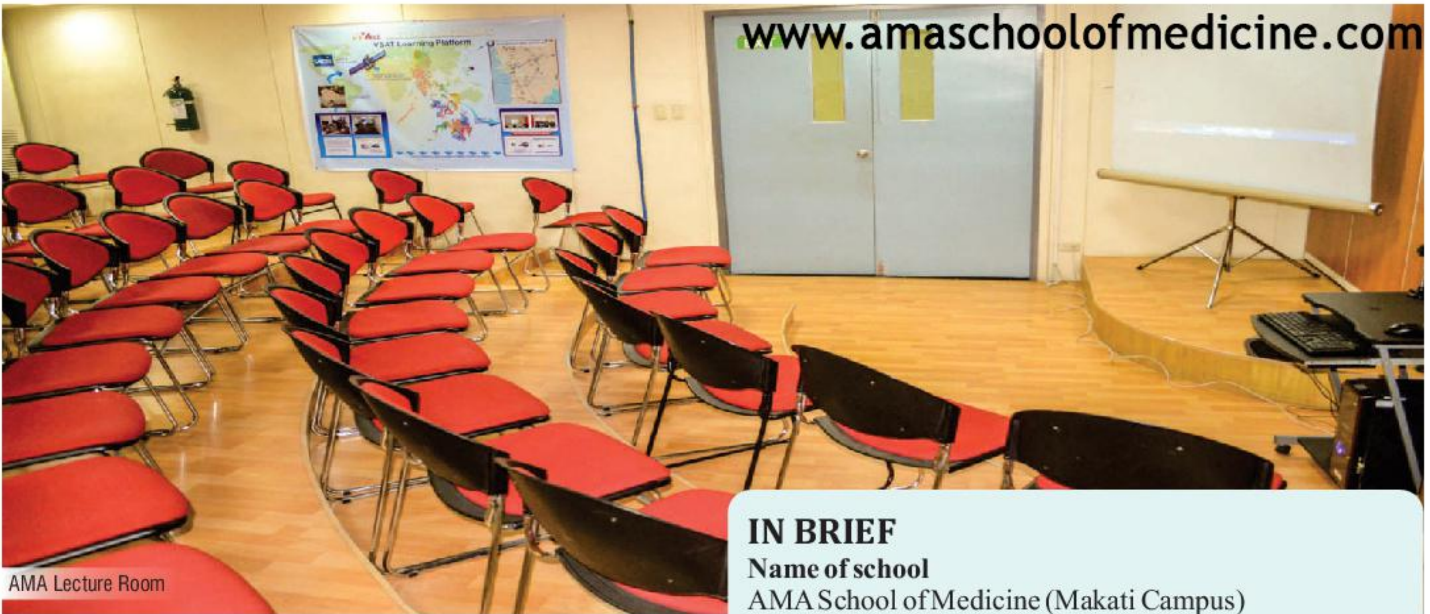
AMA Lecture Room