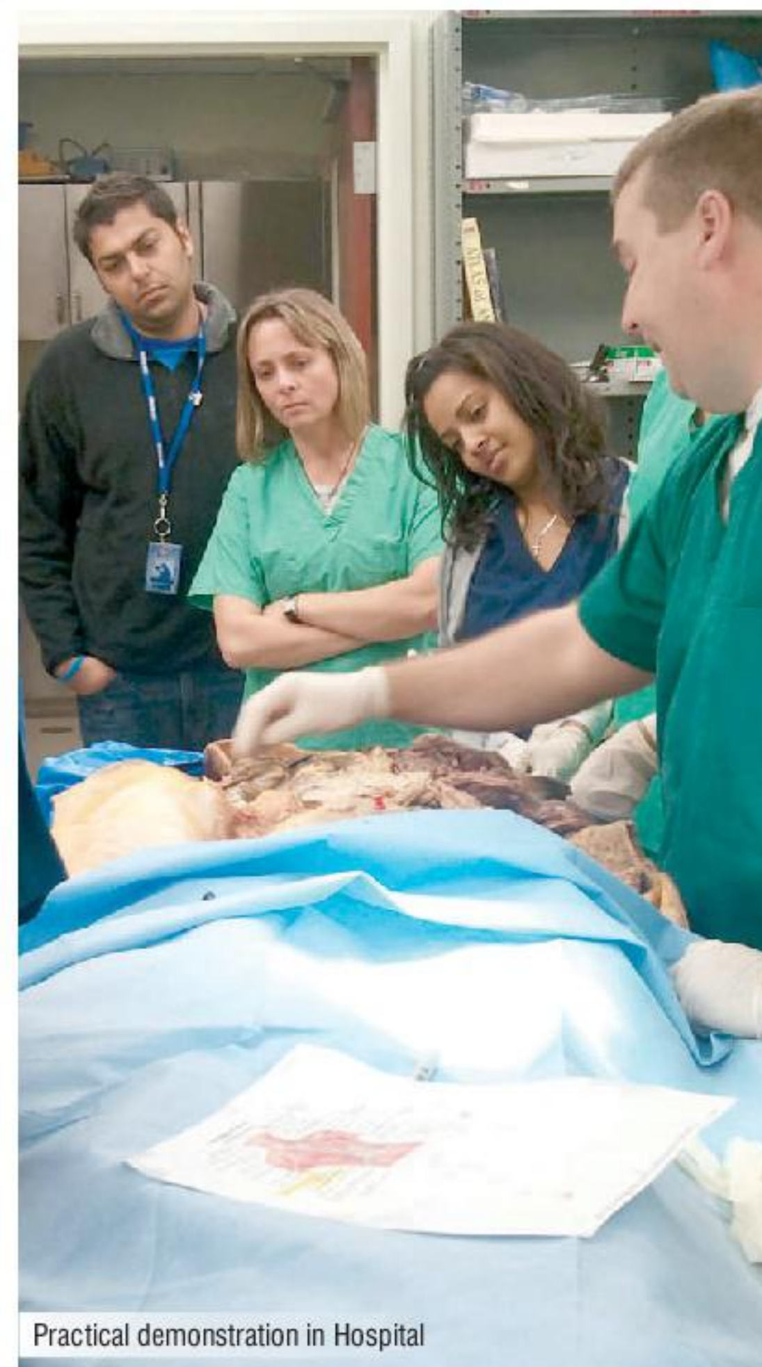
Practical demonstration in Hospital

MCI preparation : Study material will be provided in Manila. Followed by coaching in INDIA to ensure 100% MCI pass rate (At students own cost).