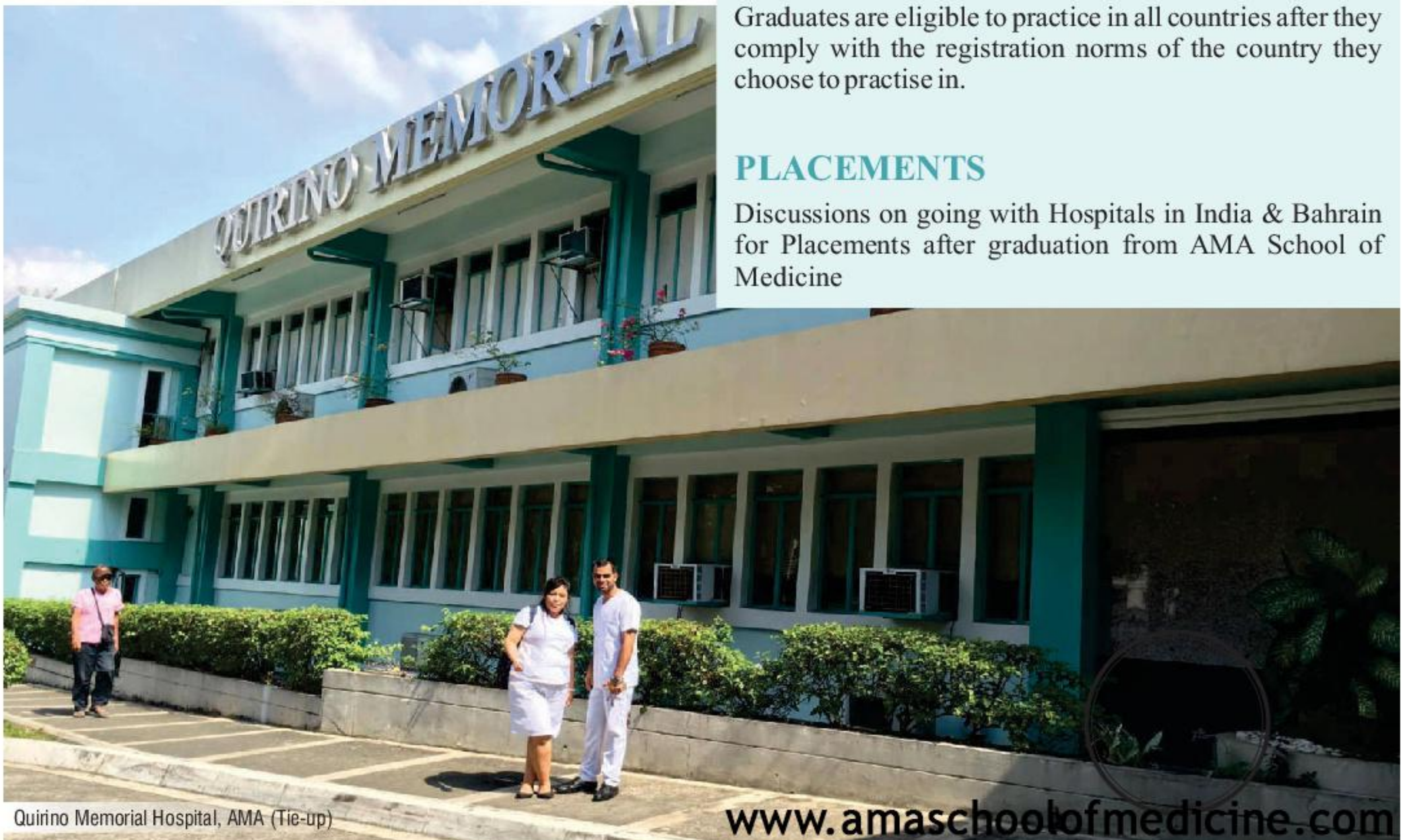
Quirino Memorial Hospital, AMA (Tie-up)

Discussions on going with Hospitals in India & Bahrain for Placements after graduation from AMA School of Medicine