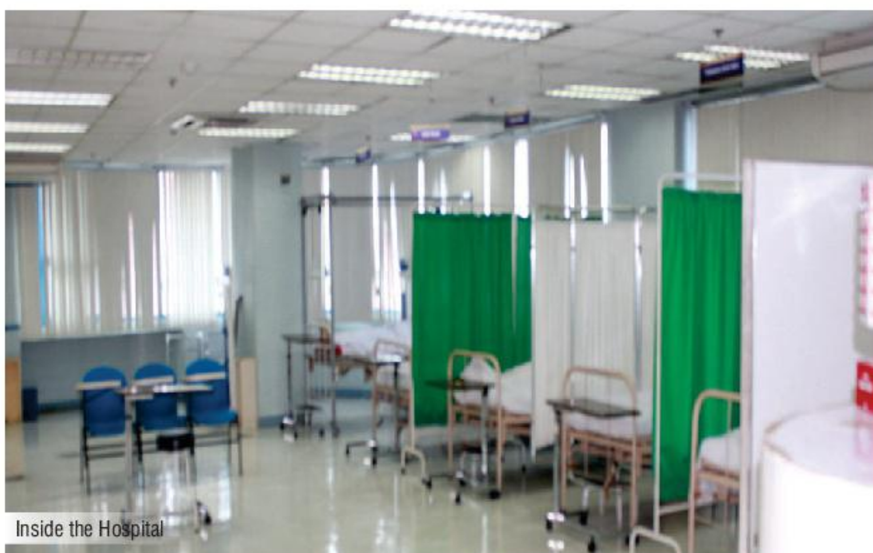
Inside the Hospital