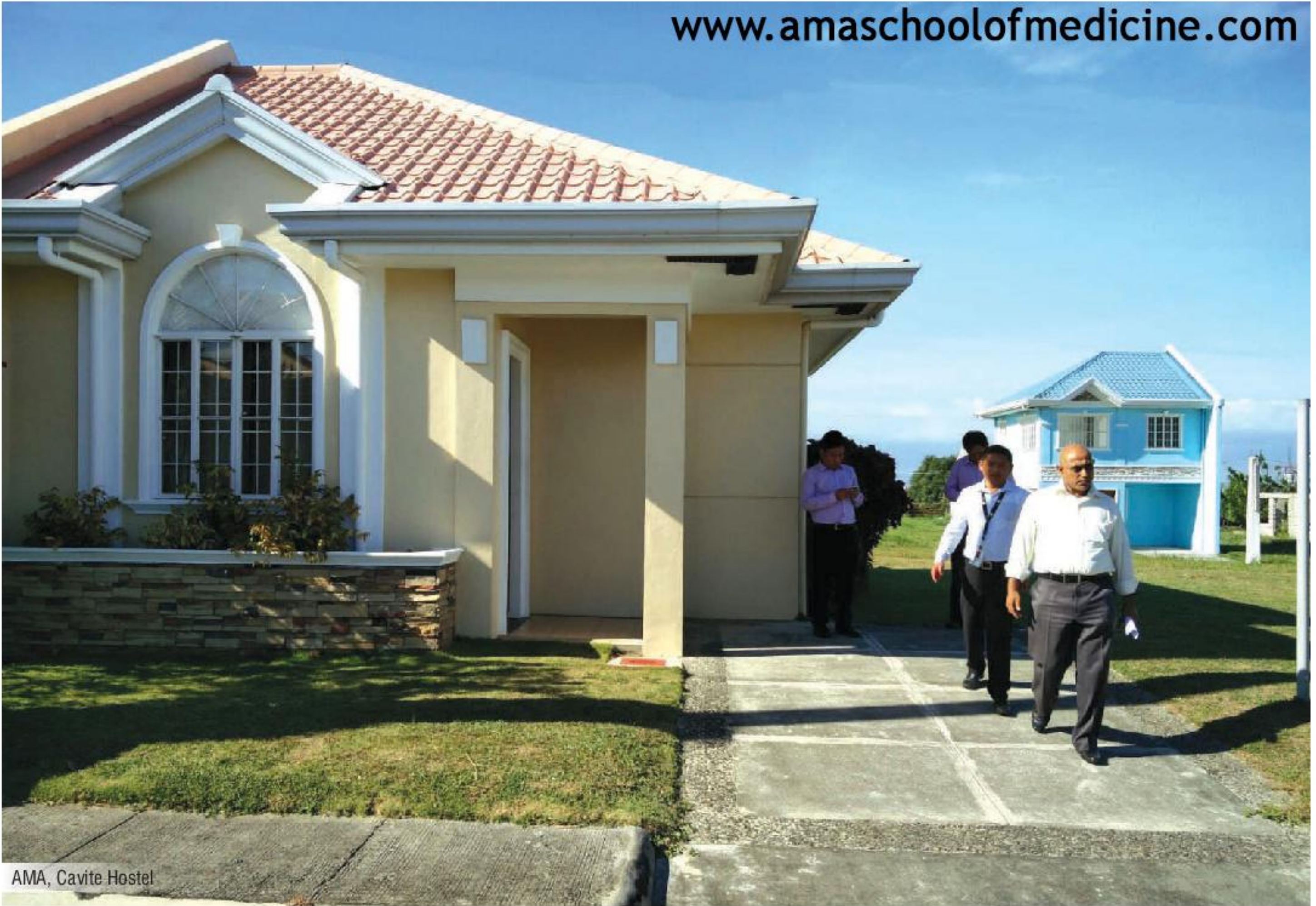
AMA, Cavite Hostel