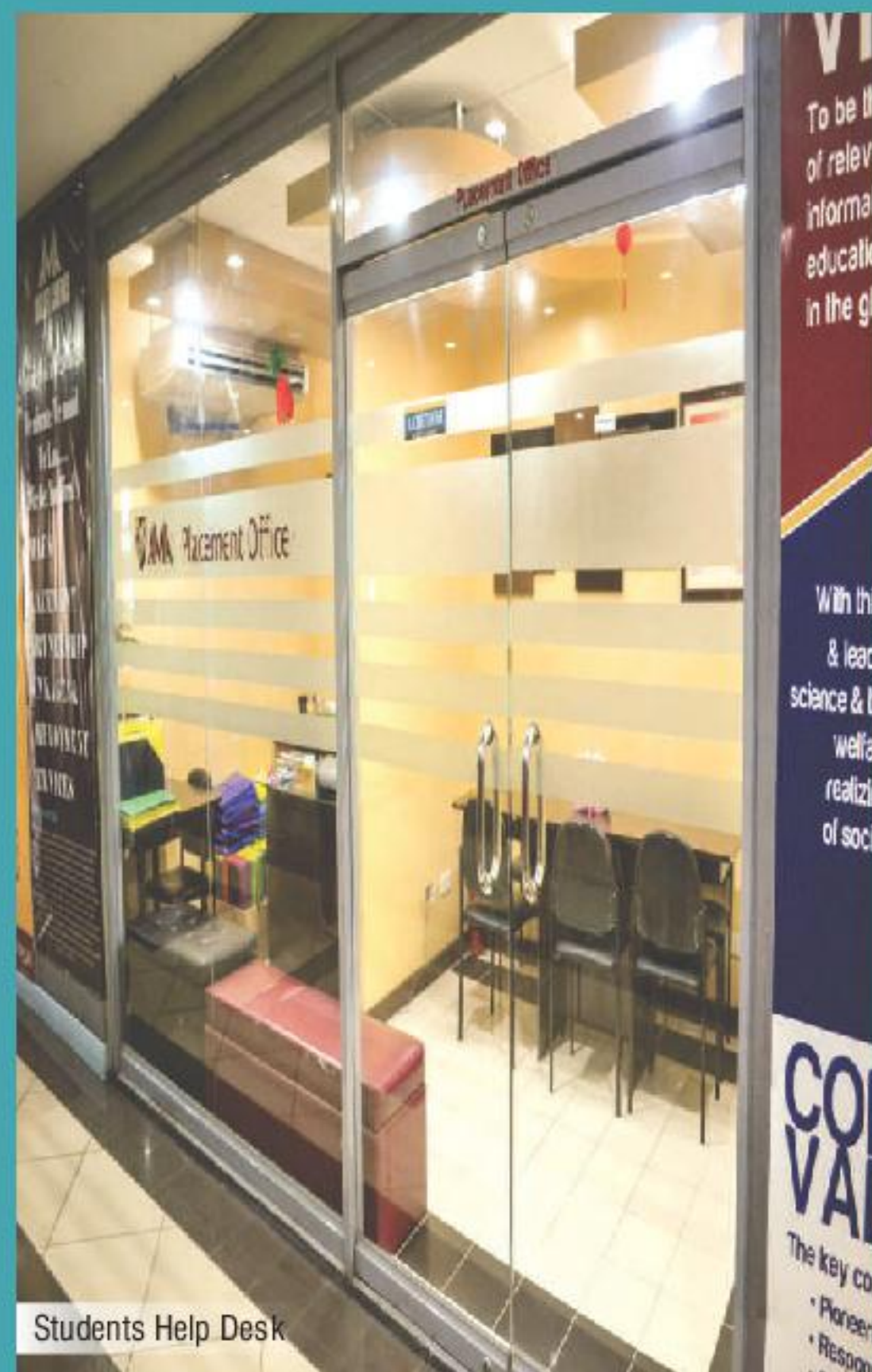
Students Help Desk