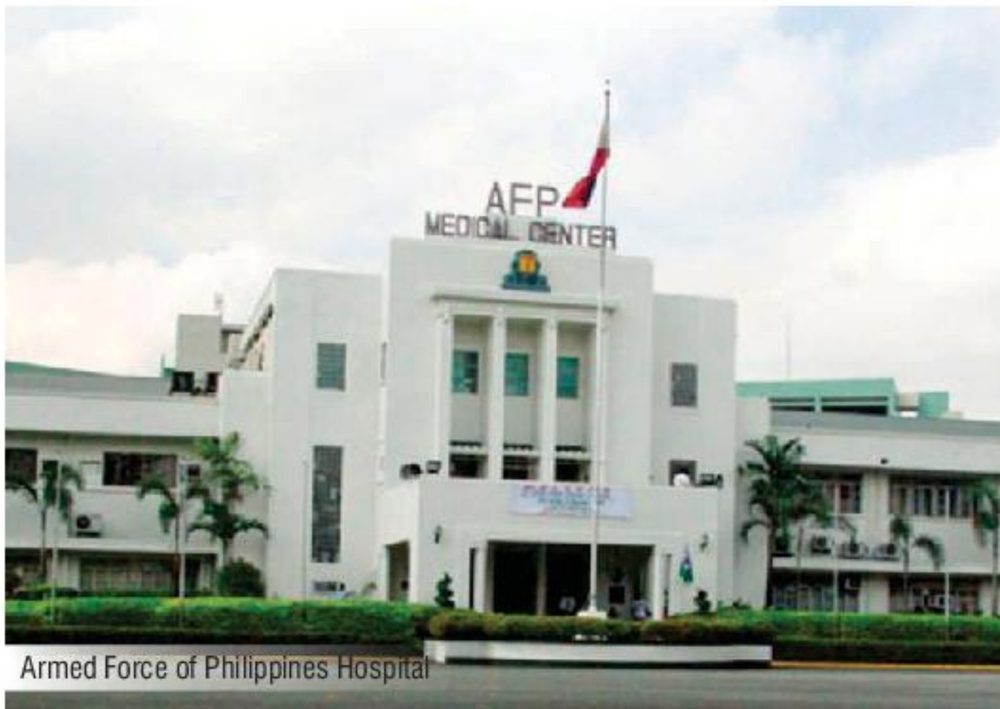
Armed Force of Philippines Hospital

Indian Students from AMA School of Medicine are eligible for MCI Screening test and be licensed to practice in India.