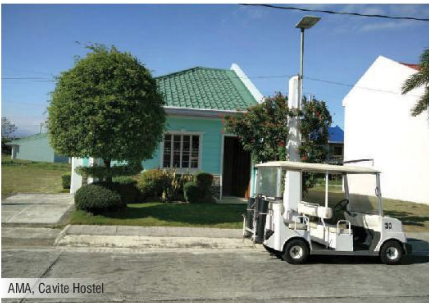
AMA, Cavite Hostel

There are plenty of eating places nearby. India food / catering arrangements are made for students from India. Laundry arrangements are there for students.